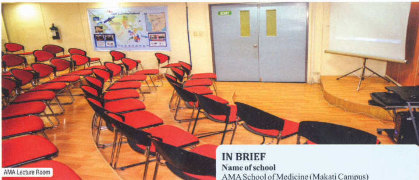
AMA Lecture Room