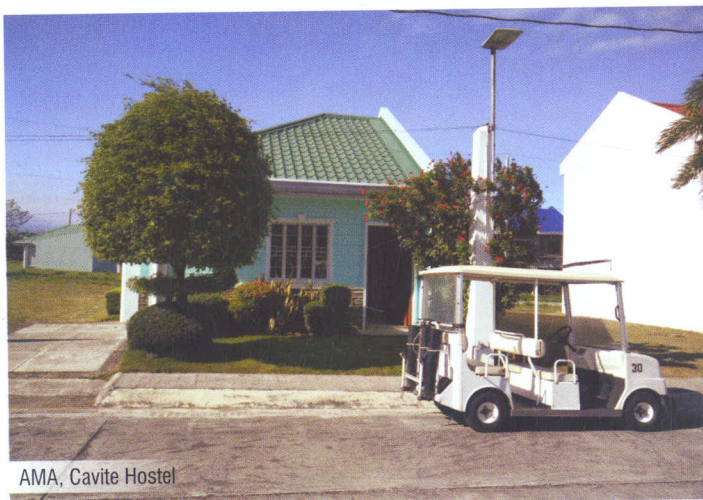
AMA, Cavite Hostel

There are plenty of eating places nearby. India food / catering arrangements are made for students from India. Laundry arrangements are there for students.