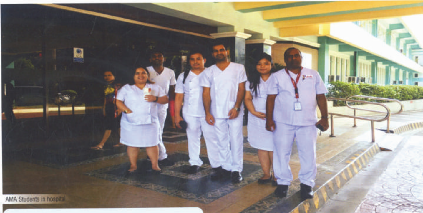
AMA Students in hospital