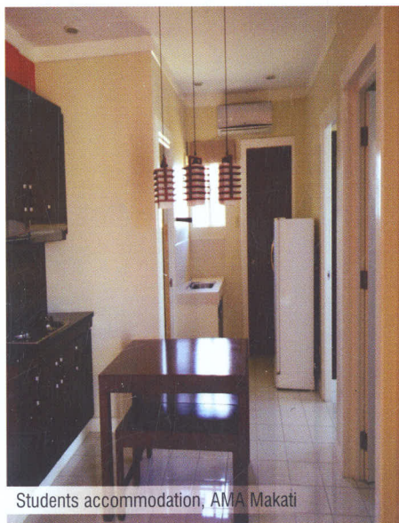
Students accommodation, AMA Makati