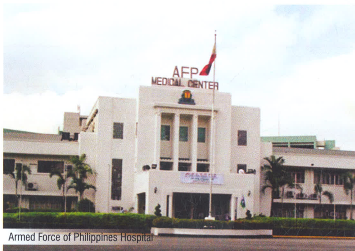
Armed Force of Philippines Hospital

Indian Students from AMA School of Medicine are eligible for MCI Screening test and be licensed to practice in India.