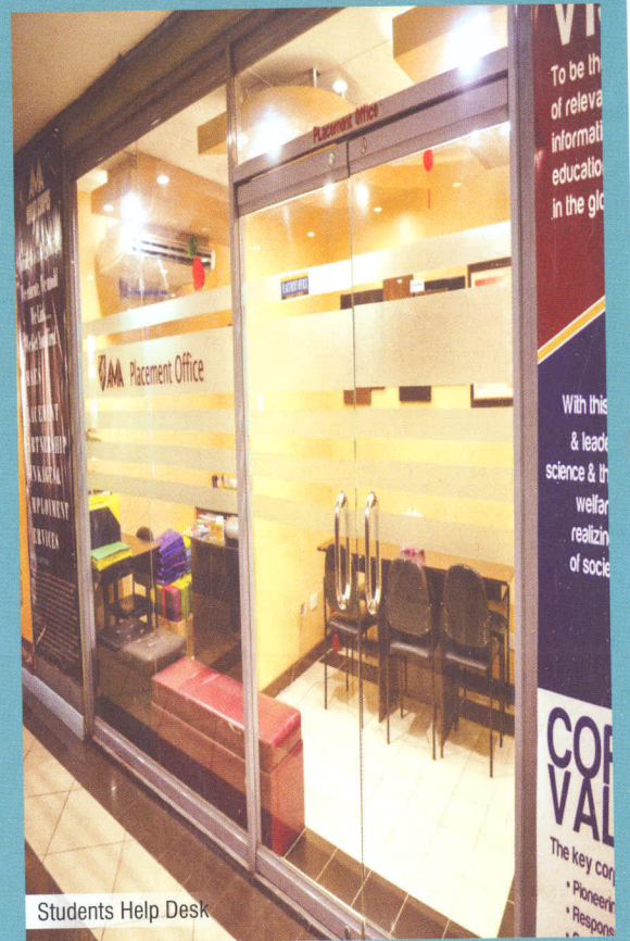
Students Help Desk

▶▶ Preference to students with better academic credentials