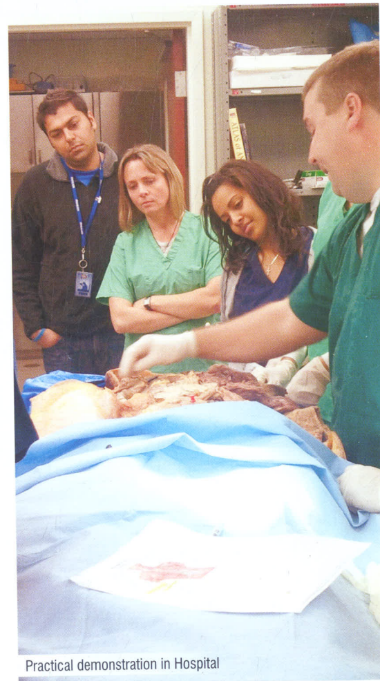
Practical demonstration in Hospital

MCI preparation : Study material will be provided in Manila. Followed by coaching in INDIA to ensure 100% MCI pass rate (At students own cost).