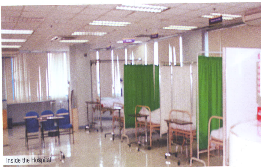
Inside the Hospital