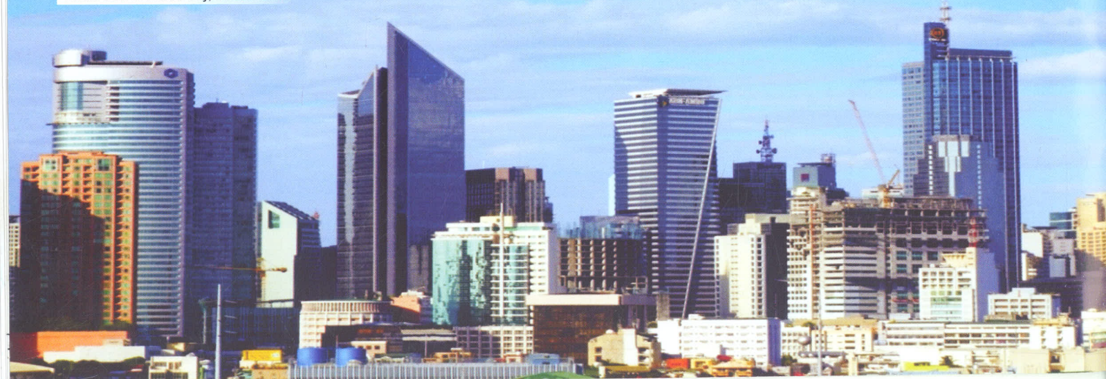
Actual view of Makati City, Metro Manila

Internal Medicine, Surgery, Pediatrics, Obstetrics & Gynecology, Eye, Ear, Nose and Throat, Psychiatry, Community Medicine, Electives.