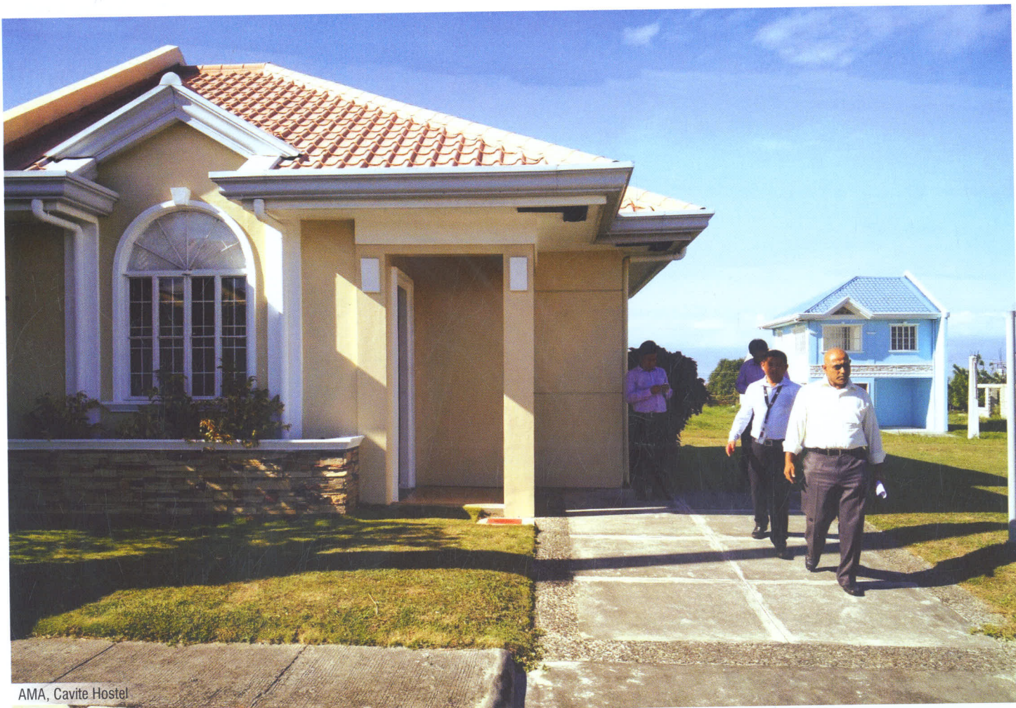
AMA, Cavite Hostel