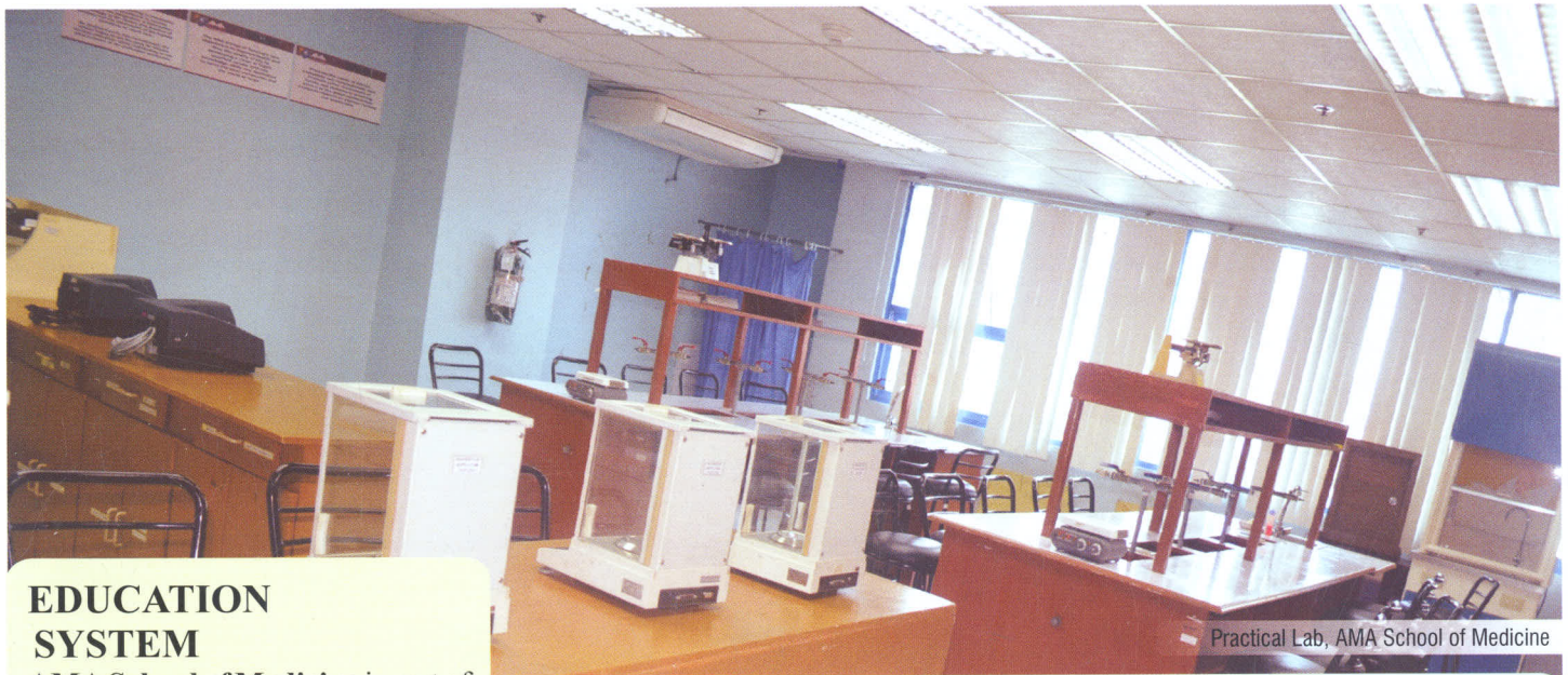
Practical Lab, AMA School of Medicine