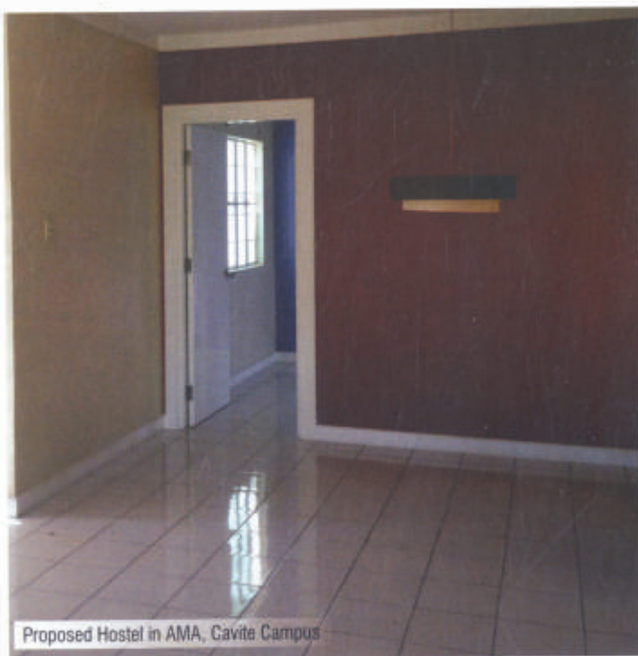
Proposed Hostel in AMA, Cavite Campus

Cavite is surrounded by Laguna province to the east, Metro Manila to the northeast, and Batangas province to the south. To the west lies the West Philippine Sea. Cavite is the second smallest province in the CALABARZON region.